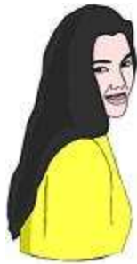
She has long hair. Her hair is long.