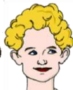
They have short hair. Their hair is short.

This is my cake – and you're not having any of it! Is t his your car? Or is it the other one? Her father is very sick – she has to go to the hospital. His sister is getting married this weekend. Our house will be built in Dhaid, next to the mosque. Their s on is studying at university in Australia.