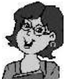
I have dark hair. My hair is dark.